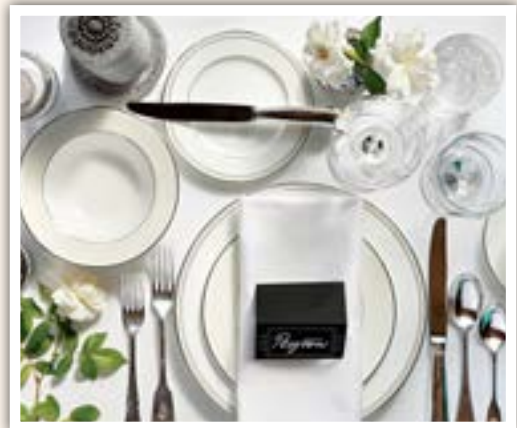
TABLE SETTING AND SERVICE WORKSHOP

There will also be a demonstration of the famous 'Flaming Lamborghini' drink. They will learn two of the school's very own mocktails which were created by students.